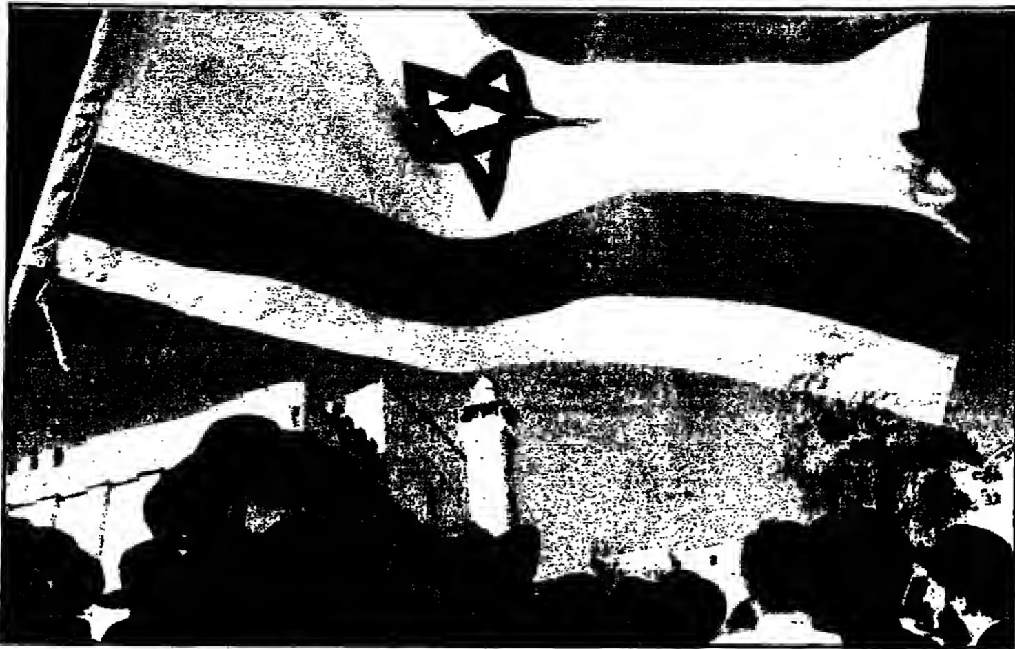
Some of the thousands of demonstrators against Hebron redeployment rally at the Machpela Cave yesterday. See story below.